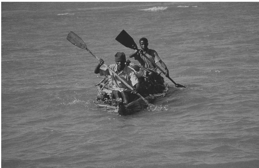
10. A tankwa or papyrus boat like this may have brought the Ark in flight to a safe haven on Lake Tana, if Ethiopian legends relate the truth.

It is difficult to divine exactly what Yeshaq and his collaborators intended to say here. Masas seems likely to be the port of Massawa on the Red Sea, from