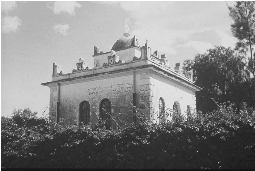
7. The treasury of Yohannes IV at Maryam Seyon church, Aksum. Next to it once stood the small Zion church, in which the Ark was kept.

Bruce cites an occasion when the reigning king, Takla Haymanot II, talked to him about the Ark. The young ruler claimed that 'whatever this might be it was destroyed, with the church itself, by Mahomet Gragh, though pretended falsely to subsist there still'. The king may well have told Bruce this – it would be very interesting to know if he really believed it. But bearing in mind Shihab al-Din's testimony about the withdrawal of the great 'idol'