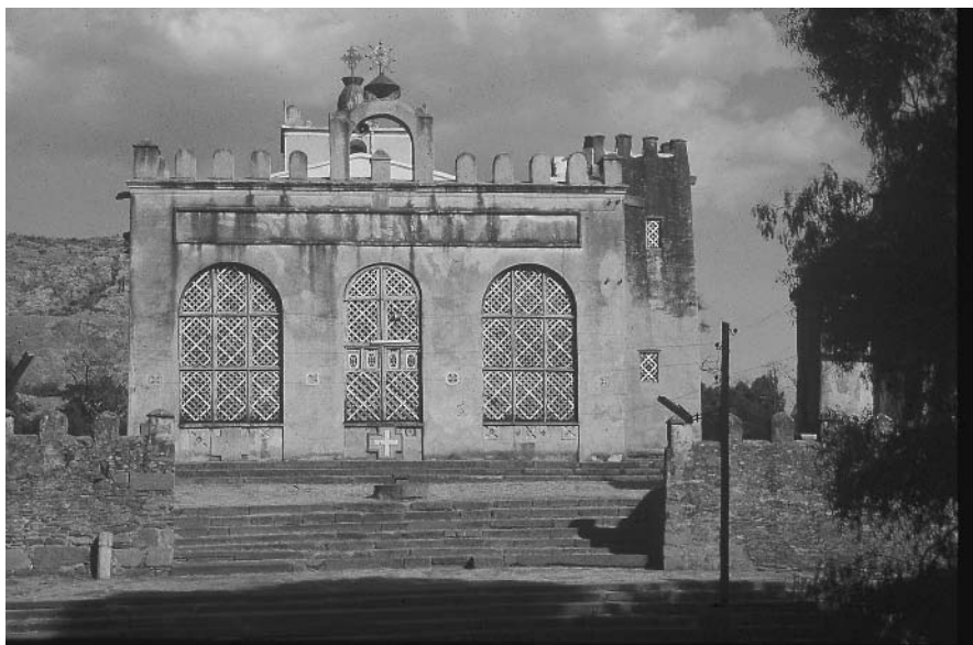
8. The western terrace and steps at Maryam Seyon church, Aksum, surmounted by the façade of Christian Ethiopia's holiest shrine.

The present church of Mary of Zion – Maryam Seyon or Enda Seyon (Place/Dwelling of Zion) – at Aksum is the very late descendant of a number of other structures built successively on the same spot. Despite the tendency to refer to it as the 'great' or 'cathedral' church of Maryam Seyon, the present building is a relatively modest stone-built edifice little larger than ordinary parish churches in small villages in other Christian lands. Although tradition places it at the centre of antique-seeming traditions, it is a mid-17th century