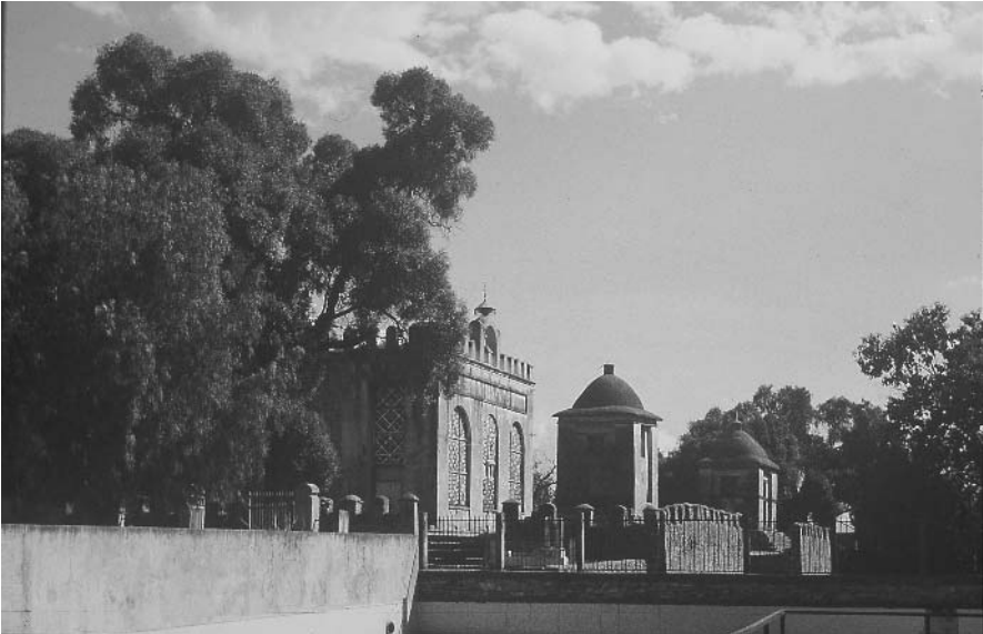
9. Sunset light falls on the west front of Maryam Seyon church, Aksum, and its two flanking towers on the west terrace.

The truth is that we lack any genuine information whatsoever about the church of Mary of Zion during the whole of its existence until the 1520 description by Alvares, aside from occasional brief mentions in Ethiopian and foreign documentation which do little more than confirm the existence of a church there. The hints from c. 1400 are that it was richly decorated, and important. True, something can be inferred from the excavations just noted, and from the remaining traces of Aksumite walling below the church. What do these tell us? Merely that there was a building, apparently of domestic use, close beside and probably running underneath the present podium of the church, in pre-Christian Aksumite times, followed by another structure