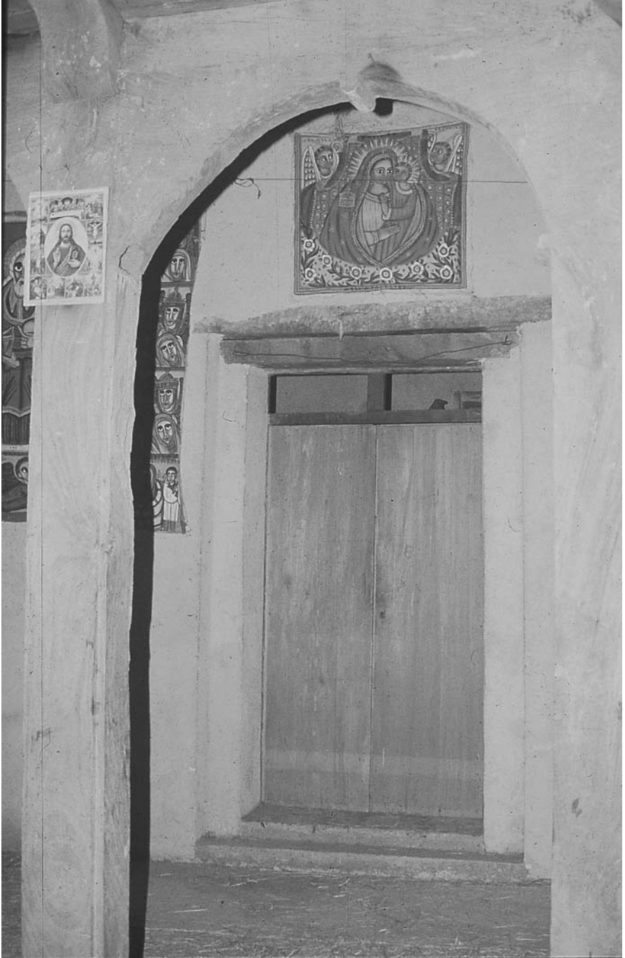
3. Entrance to the sanctuary in the church of Abba Pantelewion, near Aksum. Inside is a manbara tabot with a pillared and domed top, in which the tabot is kept.