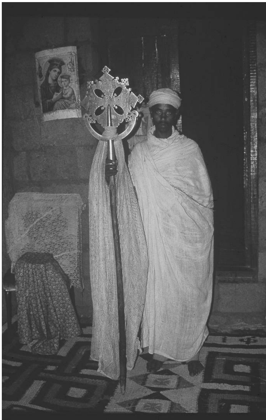
6. A priest exhibits a magnificent processional cross in one of the churches of Lalibela.